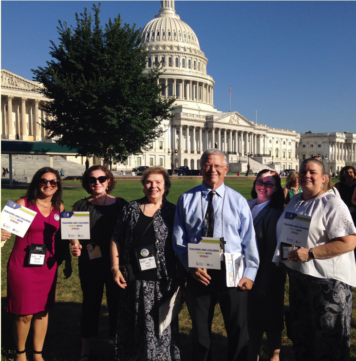
Our 2018 Special Education Legislative Summit team in Washington, DC.